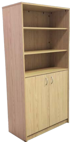
WALL UNIT 854006

Traditional all melamine construction bookcase and lockable cupboard. 2 shelves in open section and 1 internal shelf.