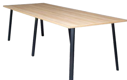
BELLA BOARDROOM TABLE 441019

Colours: Top: Laminex Melamine Range A and B Base: Black and Silver