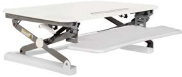
RAPID RISER B30-854001/2

Height adjustable platform for existing desks. Gas spring for smooth adjustment with control levers either side.