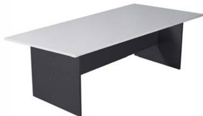
CLASSIC BOARDROOM TABLE 441042/3

Rectangular melamine boardroom table with centre panel.