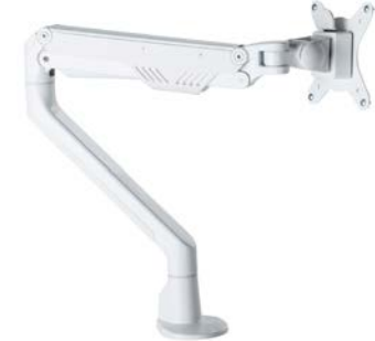
ELEVATE ARM 441027

Single monitor arm that attaches to your desk and allows movement of monitor to best suit the user.