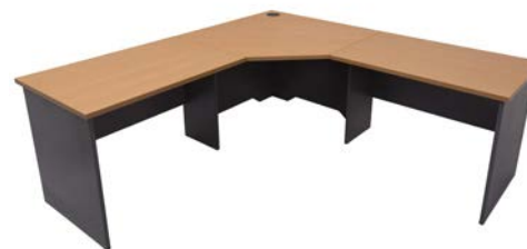
CLASSIC WORKSTATION 441041

Melamine corner workstation - 3 piece construction.