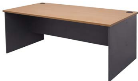
CLASSIC OFFICE DESK 441040

Single Sided Melamine desk with modesty panel.