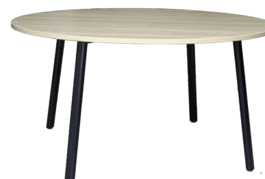
BELLA ROUND MEETING TABLE 441018

Sleek round meeting table with oval shape legs, fully welded and powdercoated.