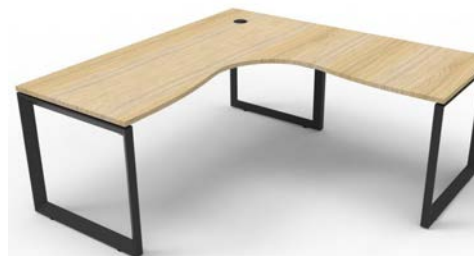
EDGE WORKSTATION 441035

Colours: Frame: White or Black Top: Laminex Melamine Range A and B