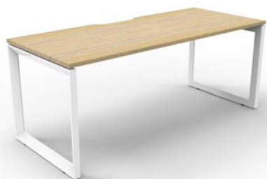
EDGE DESK 441034

Single Sided Workstation with scallop edge (no screen) and loop legs.