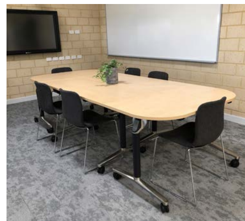
MODULAR MEETING TABLE 441042

Modular mobile flip top stackable tables form many configurations, suiting any meeting space. Joining clips available for purchase.