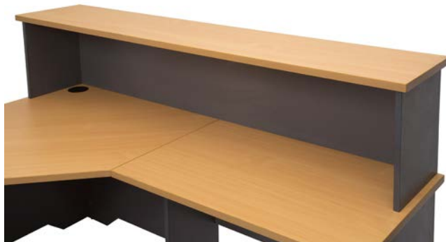
DESK HOB B30-920007

Rectangular Reception Hob for existing workstation.