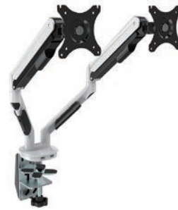
MONITOR ARM B70-854004/5

Made of aircraft aluminium. Screen tilt adjustment. Double USB ports. Intergrated cable management. Support monitor up to 30".